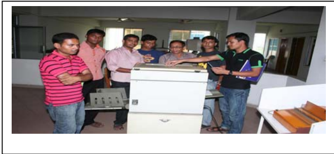
Uv̄B̄k̄ac M̄AYK̄ix̄t̄ i d̄t̄Uv̄K̄ac t̄ḡkb̄ c̄ii P̄ij̄ b̄v̄ c̄ik̄'Ȳ

M̄tel̄ K̄t̄ i M̄tel̄ Yv̄ Kḡ, d̄t̄Uv̄M̄ōd̄ BZ̄ w̄ gvBt̄μwdg, gvBt̄μwdm-Gi gva't̄ḡ x̄N̄'ḡq̄v̄t̄ m̄sī ŋ̄t̄Yī e'ēv̄ G tmevi Avl̄ Zv̄q̄ Kiv̄ nq̄ | G Qvov̄ M̄tel̄ Yvī w̄el̄ qē i e'Áv̄b̄K̄ d̄t̄Uv̄M̄ōnd̄, v̄B̄W̄ ^Zixī e'ēv̄l̄ GLv̄tb̄ w̄e'gv̄b̄ | Z̄tē Z̄ c̄h̄ȳ 3 i e'vc̄K̄ c̄h̄v̄t̄ī d̄t̄j̄ G me tmevi Pw̄n̄ v̄ tb̄B̄ ej̄ t̄j̄ B̄ P̄t̄j̄ | Z̄tē M̄tel̄ KMȲ Zv̄t̄ i M̄tel̄ Yv̄ c̄l̄ ev̄ Ab̄ t̄Kv̄b̄ WK̄t̄ḡŪ t̄j̄ wgt̄bw̄S, v̄v̄B̄ij̄ ev̄B̄īŪs, d̄t̄Uv̄K̄ac̄ f̄ ḡt̄j̄ G w̄ef̄v̄M̄ n̄t̄Z̄ K̄t̄ī w̄b̄t̄Z̄ cv̄t̄īb̄ | 2010-2011 A_ēQ̄t̄ī 32,497 c̄p̄v̄ d̄t̄Uv̄K̄ac̄, d̄t̄Uv̄M̄ōdx̄ 350 w̄U, t̄j̄ wgt̄bw̄S 27 w̄U Ges 996 w̄U v̄v̄B̄ij̄ ev̄B̄īŪs̄ K̄t̄ī Pw̄n̄ v̄K̄ix̄t̄ i gv̄t̄S̄ mī eiv̄n̄ Kiv̄ nt̄q̄t̄Q̄ |