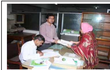
wĕAvbx I Mtel K WKĕgĕUkb tmev wĕt'Ob

Mtel KMY Zv`i Mtel Yvi mvĕ_ msukē Ab'vb` Mtel Yvi djvdj Rvbi Rb` cĕkĕwKZ AvUĕĕ'vj msMĕh Kti _vĕKb | e'w³MZ cĕĕPóvq A_ev e'vYWK ev Ab'vb` jvBĕĕĕx/WKĕgUkb tĕmUvĕi cĕkĕwKZ AvUĕĕ'vĕj i weewj IMĕnd ev G'vemUĕĕm cvl qv tMĕj I Mtel Yvi we`wii Z weei Y mĕĕĕj Z AvUĕĕ'vj msMĕh Kiv e'w³i cĕĕĕĕ Amĕĕ nĕq cĕo | Mtel Kti i G ai tYi AvUĕĕ'vj msMĕni Pwn`vi tĕĕĕĕĕ e'vYWK t' k-wĕĕ' tĕki wewfbēZ_ tK>^ t' tĕK WKĕgU msMĕh Kti Pwn`vKiv Mtel Kti i msieivn Kti _vĕK | cĕĕgZt e'vYWK-Gi WKĕgĕUkb wewfM e'vYWK-Gi wBR^ Z_ fvŪvi nĕZ msukē WKĕgU msMĕni tPóv Kti _vĕK | e'vYWK-Gi wBR^ cĕkĕv b'vkbvj K'vUvj M Ae mvĕqUwUdK GŪ tUKĕbvj wRK'vj wciw I wK'vj m Bb evsj vĕ`k A_ev t' tĕki Ab'vb` jvBĕĕĕx nĕZ AvUĕĕ'vj msMĕh Kti Zv Mtel Kti i cĕo vb Kti _vĕK |