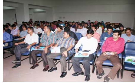
R M b e w e k j e v j t q t m g b v i