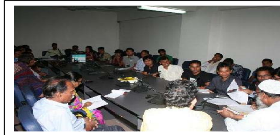
e v Y W K - G i g n i c n i P r j K B u v Y R i c M h Y K v i x Q r T - Q r T x i g r S K m w b t Q b