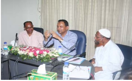
ci v g k m f v q g v b b x q m i P e g t n r q