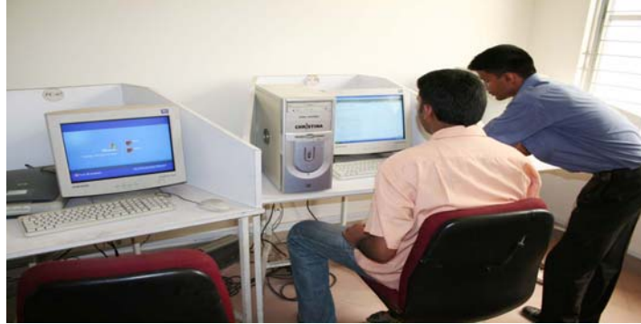
e'vYWK mvBevi KYfi

e'vYWK MstMvfi GKw mvBevi Kbfi mshy 3 Kiv ntqtQ| AvcvZZt`WU KwuDUvfi BvUvftBU msthvM c0vftbi gva'tg Gi Kvhp'rg 'ii' ntqtQ| MstMvi e'envi Kvixiv webvg'fj' G mvBevi Kbfi BvUvftBU e'envi KitZ cvtib I c0qvRbxq WKtgU 'f g'fj' wCUU Kfi wbtZ cvtib|