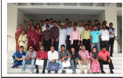
e v Y W K O - a B u v Y R i c M h Y K v i x Q r T - Q r T x