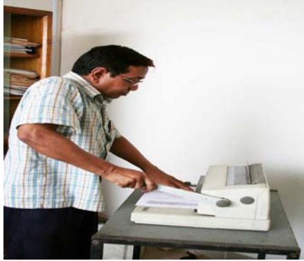
MōnK tmevi Rb̄ t̄j wgt̄bw̄S Kiv nt̄'Q