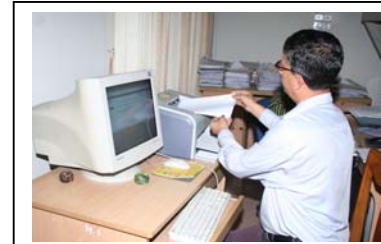
wĕAvbx I Mtel K-tKWKĕgĕU wĕŪ t' qv nĕ'Q

G Qrov e'vYWK-Gi cĕĕekwĕKvi AvĕQ Ggb wKQy wĕĕ`kx I tĕqemvBU (HINARI, AGORA, INASP PERii BZ'w` ) nĕZ WKĕgU msMĕh Kti _vĕK |